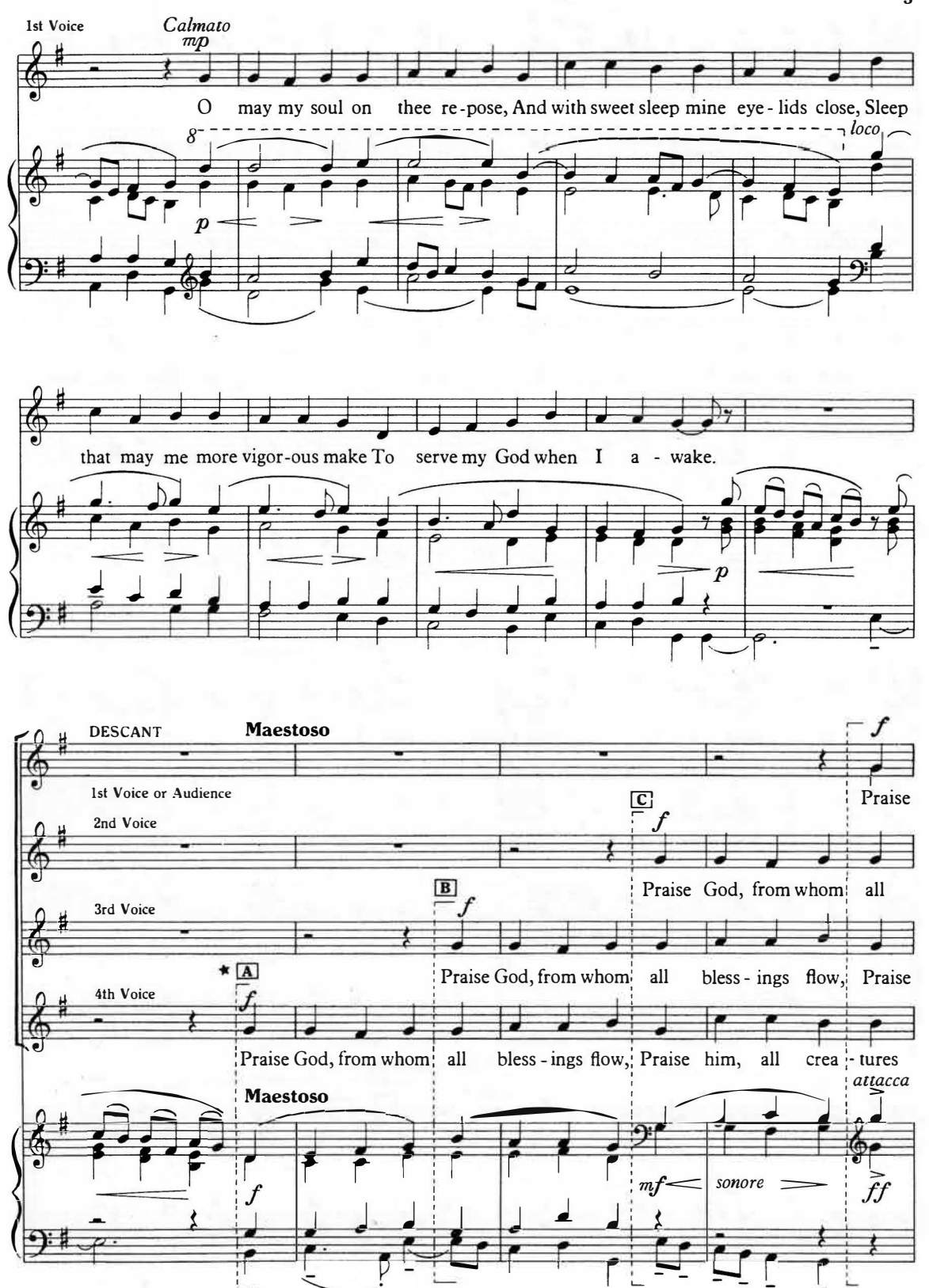
*Where the resources of a choir do not permit of the division into five parts, the conductor may omit bars A, A and B, or A, B, and C, thereby omitting the 4th, 3rd and 4th, or 2nd, 3rd and 4th voices respectively. Glory to thee, my God, this night